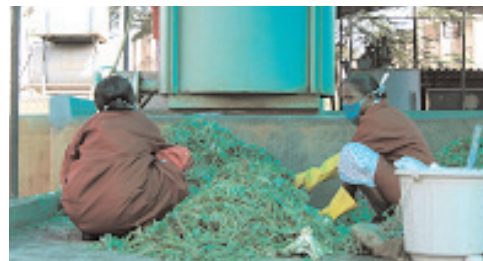
Technical visit in Mumbai Bio-gas production

Materials and leaflets related to the ecoBUDGET-Asia project were distributed, raising the interest of several Asian local bodies.